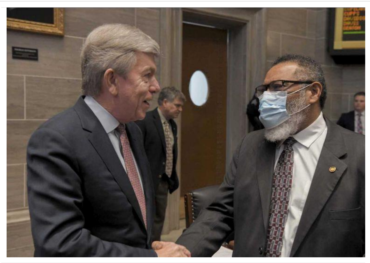
I spoke with U.S. Senator Roy Blunt on Wednesday about the possible timeline for passage of the Build Back Better Plan. Portions of such funding can be used by MoDOT to make safety improvements along Bruce Watkins Drive (71 Highway).