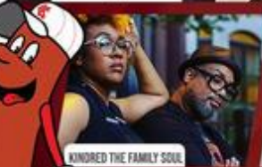
KINDRED THE FAMILY SOUL