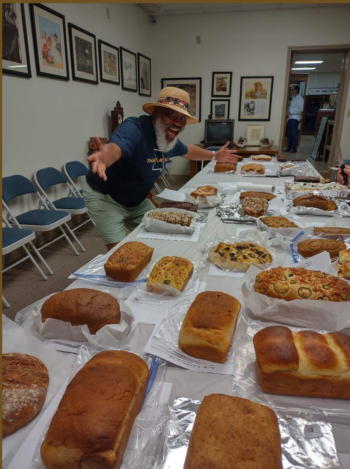
I served as a judge in the sliced bread contest on Sliced Bread Day in Chillicothe.