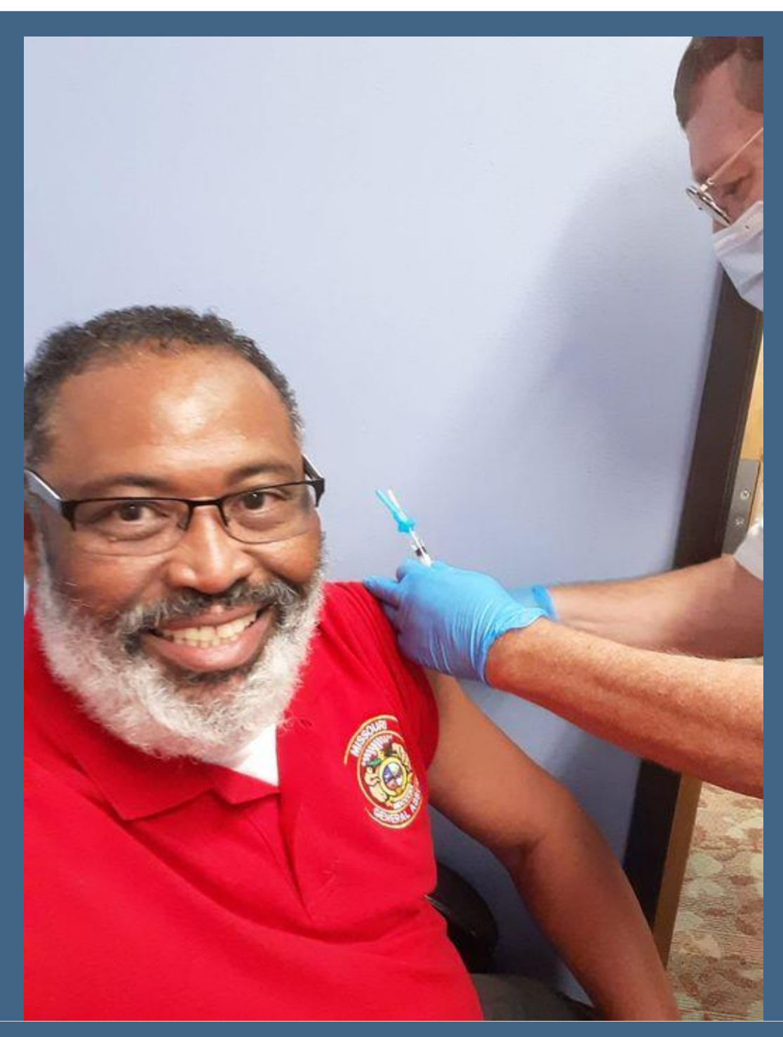
On June 28th, I received the Johnson & Johnson COVID-19 vaccine. Like many people, I too was hesitant about the vaccine and the unknowns. After careful consideration and seeing no serious outbreak of COVID after the Memorial Day holiday, I felt it was best to take the