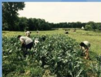
Paid Summer Job for 8 th Grade Boys

Our young men work hard on a 10-Acre farm & learn how to run a business.