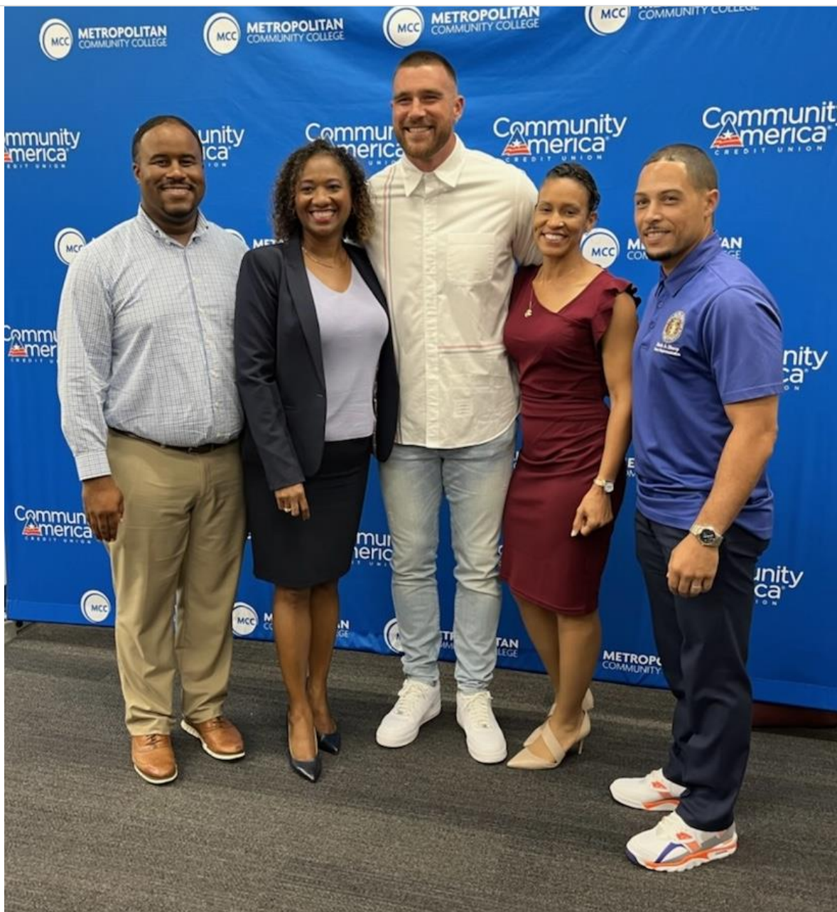
Area elected officials pose with Chiefs tight end Travis Kelce at the grand opening August 30th of CommunityAmerica Credit Union's Community Access Center at 11501 Blue Ridge Blvd. which includes classrooms for Metropolitan Community