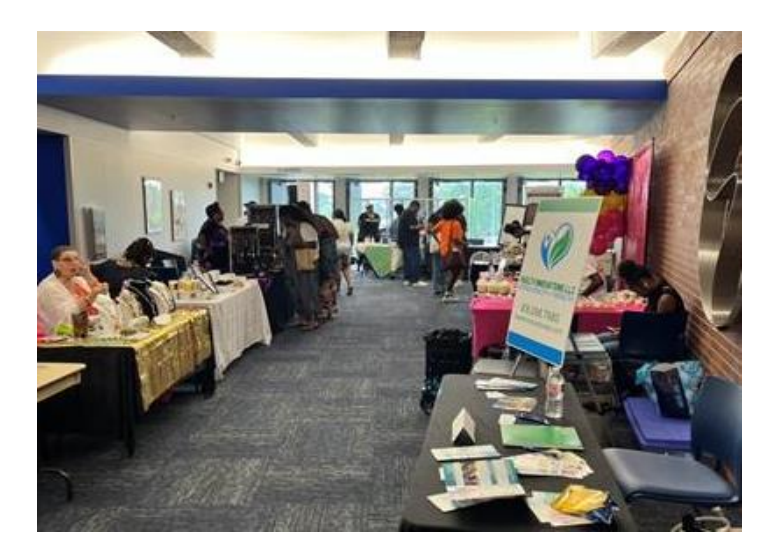
Senator Washington speaks during the panel discussion and businesses showcase their wares at "Small Business Saturday."