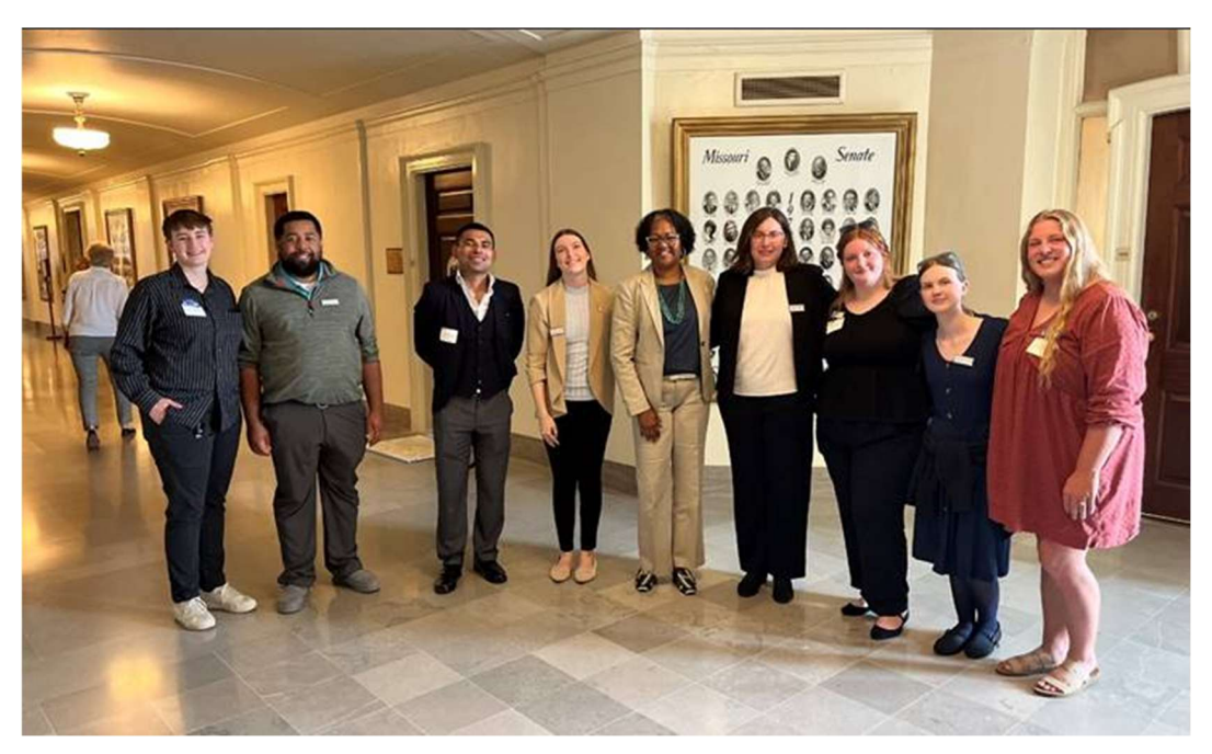
Senator Washington meets with student advocates from Metropolitan Community College.