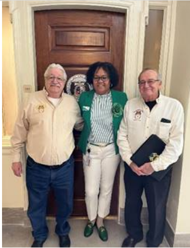
Senator Washington meets with members of the Teamsters 541.

I was also happy to meet with members of Teamsters Local Union 541 from Kansas City and representatives from the Missouri Workers Center who were advocating at the Capitol this week. The Workers Center’s tagline sums their advocacy efforts up perfectly: “United against racism – Good jobs for all!”