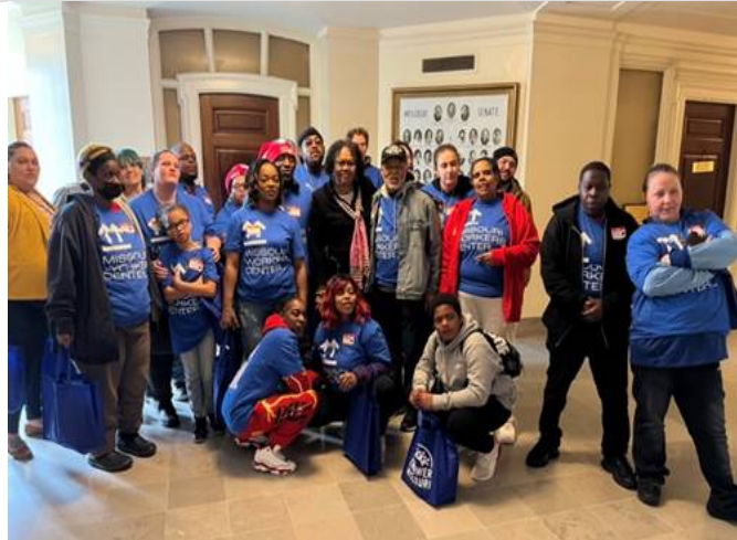
Representatives from the Missouri Workers Center meet with Sen. Washington.