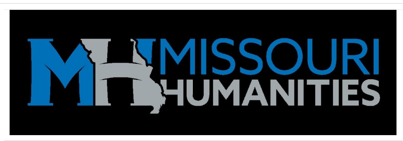
Did you know that the Missouri Humanities has a major-grants program that funds projects up to $10,000?

We have implemented a COVID-19 Vaccine Waitlist for those who meet the Missouri resident criteria for Phase 1A, Phase 1B-Tier 1, and Phase 1B-Tier 2. More information is at <u>https://www.trumed.org/forms/covid-19-vaccine-wait-list/</u> Individuals also may call 404-CARE to talk to a scheduler.